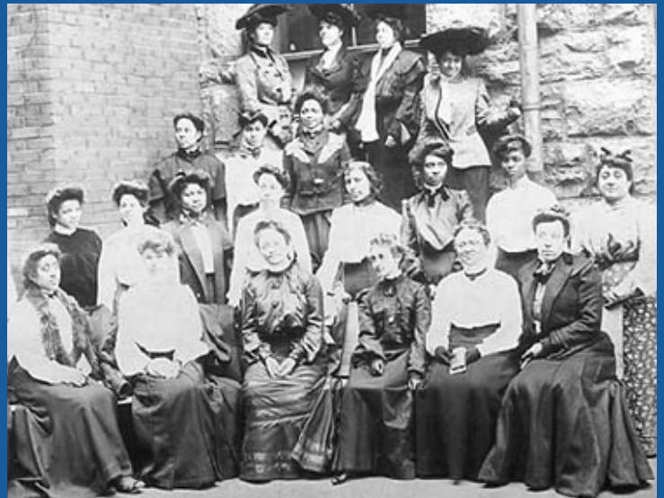
St. Louis Black kindergarten group, 1900

St. Louis, Missouri, was the first city to successfully incorporate kindergartens into the public education system in 1873, serving as a model and inspiration for advocates and educational reformers throughout the country. But early on within the St. Louis school district and later the state legislature, resistance to kindergartens arose related to the cost and funding source and the legality of serving three- to five-year-olds, as well as how kindergarten pedagogy aligned with early grades and its place in the school system hierarchy.